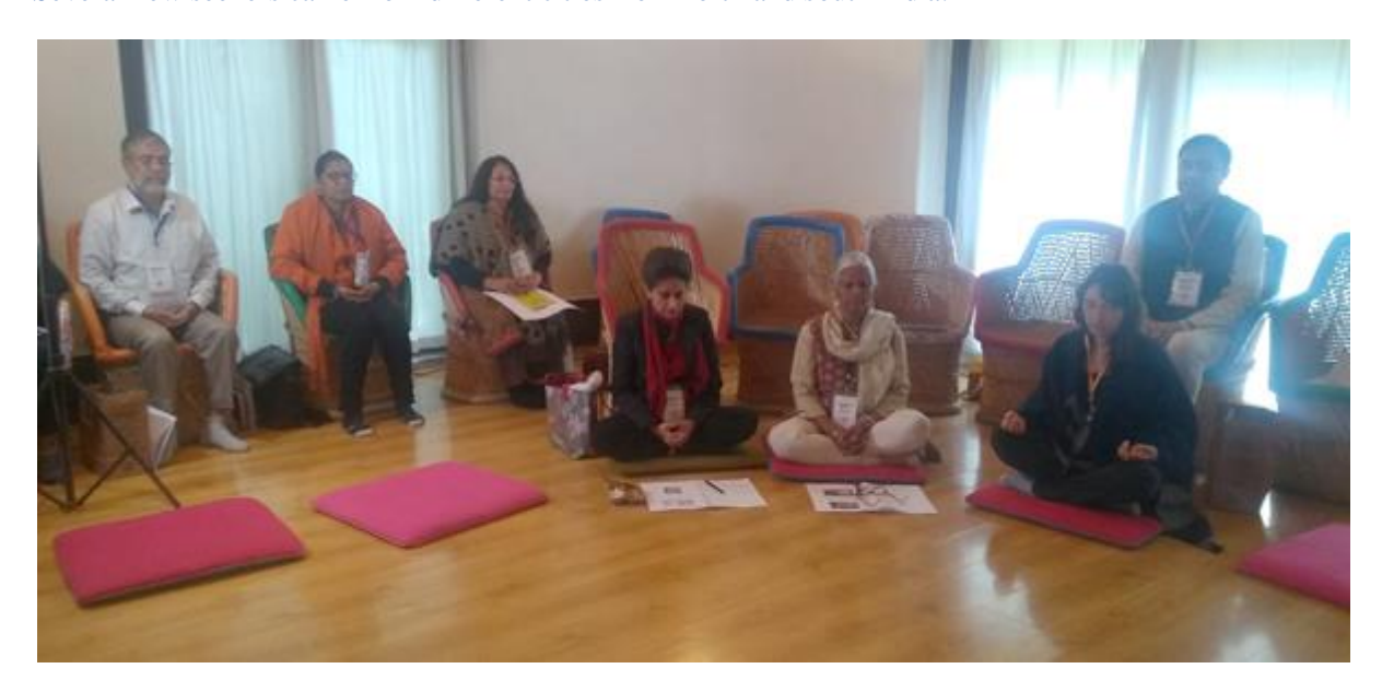
On the following Sunday, March 10, we hosted another full-day workshop, "Secrets of Attracting Money and Cosmic Abundance" at a well-known venue in Delhi, the India Habitat Center. This topic is very popular in India. The bookstall gathering and sales at both workshop venues were very encouraging.