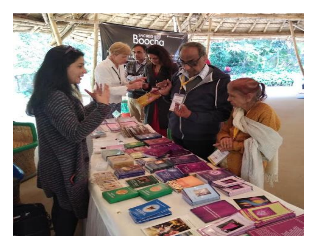
Several new seekers came from different cities from north and south India.